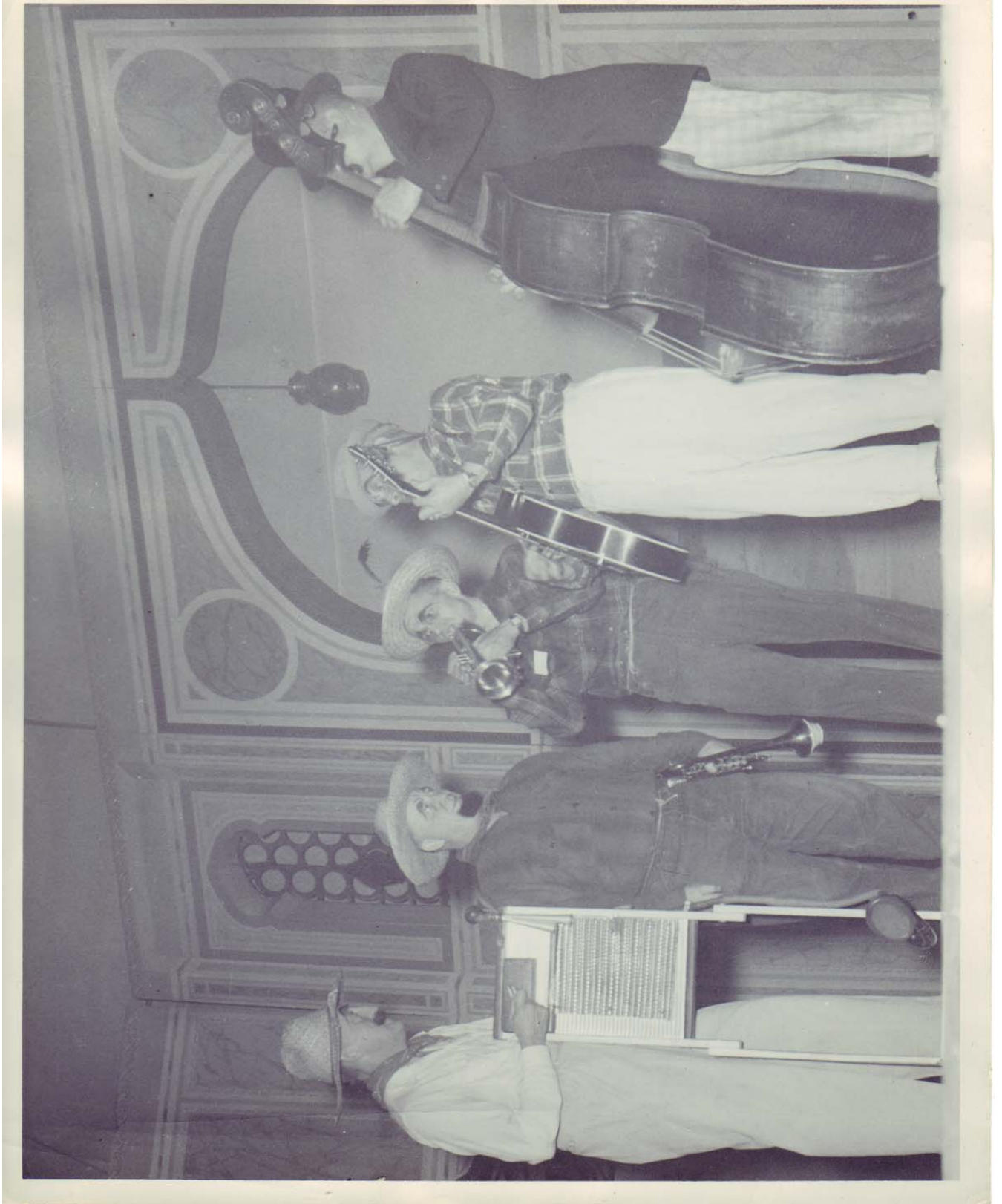
THE DAMASCUS LODGE "HOTSHOTS" - AT TRIPOLI SHRINE