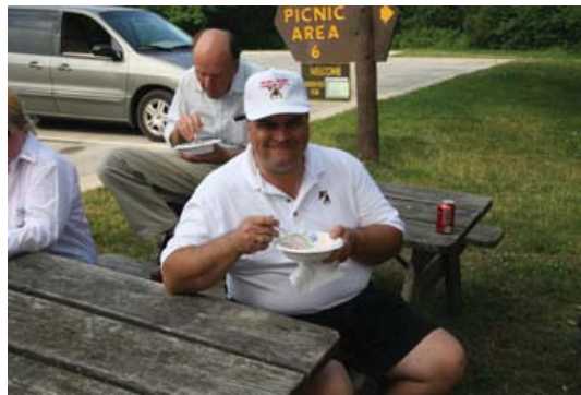
An Ice Cream Smile