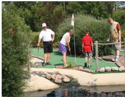
The Master and his foursome

We are all looking forward to next year's outing. We would like to thank, our Junior Warden for organizing the Family Day Event.